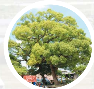
クスノキ (町の木) Camphor Tree (the official tree of Higashiura Town)