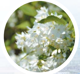
ウノハナ (町の花) Deutzia (the official flower of Higashiura Town)