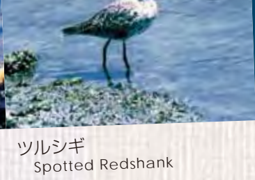
ツルシギ Spotted Redshank