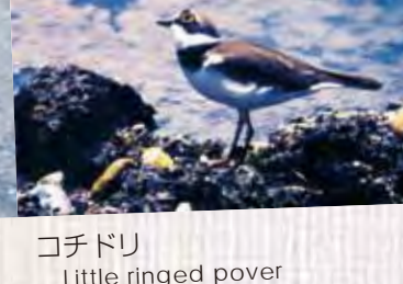
コチドリ Little ringed plover