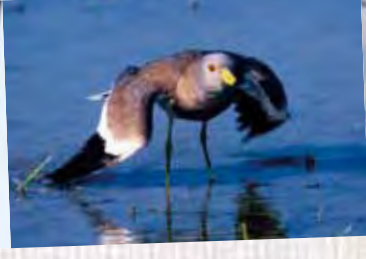
ケリ Grey-headed lapwing